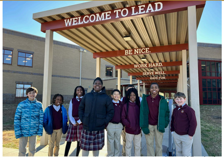
Our 5th Graders touring their middle school