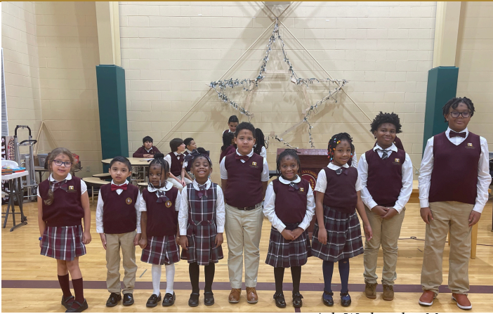
Ash Wednesday Mass