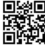
Curriculum Supply List

Your support helps our parish families and students receive the kind of formation the Church calls us to—formation that is integral, faithful, and oriented toward the growth of Christ in the lives of our young people.