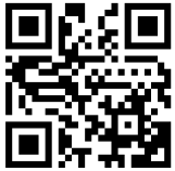
Teacher Training Supply List

Use the QR codes below to support this important work: