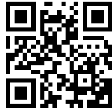
School Supply List